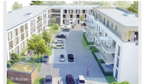
The Center for Care and Nursing Seidenhof Nettetal

m3connect's full rollout service required very little effort from KORIAN, which was a great relief for the head office. The head office only had to sign off on the process and inform each relevant facility about upcoming measures. From that point forward, m3connect took over all planning and the complete rollout with collaboration from each site. The head office was then informed about the results after each successful connection. The work on site was carried out under strict COVID-19 precautions