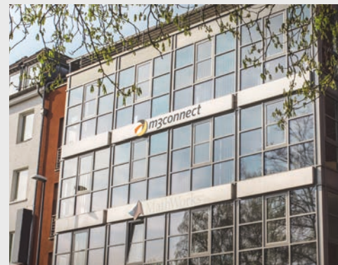
m3connect headquarters Aachen, Germany

From WiFi pioneer to market leader. Since 2001, m3connect has grown to become one of the largest wireless Internet service providers in Europe, with offices in Aachen, Karlsruhe, Munich, San Francisco, the United Arab Emirates and Sibenik (Croatia). Globally, m3connect serves 13,000 of its customers' sites in over 23 countries and, as a thought leader in cloud technologies, has been extending its self-developed platform for more than 20 years. As a technology leader, m3connect provides best-in-class wireless internet networking with flexible design. m3connect works with state of the art technologies, like WiFi, private LTE, and 5G, and creates innovative software solutions such as SD-WAN and various digital applications. m3connect's service spectrum ranges from digital signage and guest infotainment systems to VoIP, VoD, and location-based services. m3connect is a platform developer and integrates its solutions into customers' existing processes.