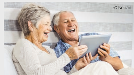
Digitalization enhances facility residents' quality of life.

KORIAN Group's German holding company is KORIAN Deutschland AG, which operates under the name KORIAN Deutschland. KORIAN Deutschland employs more than 23,000 people, and operates over 250 facilities with more than 27,000 inpatient care venues and around 3,000 assisted living apartments.